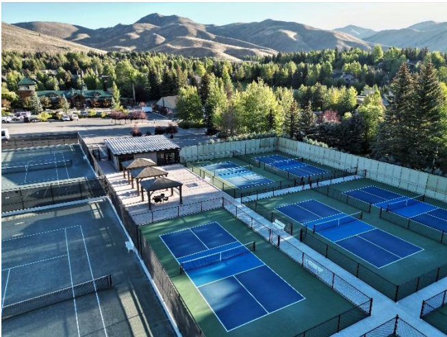
Pickleball Courts Installed 2019 | 2020 at the Village Racquet Facility

High-Altitude Balls $6 / can Onix Fuse G2 Pickleballs – $12 / 3 balls Racquet & Paddle - $5 / day per person Ball Machine - $25 Hr / $15 ½ Hr Nike Baseball Cap - $32 SVEA White or Charcoal Visor - $28