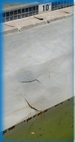
Winter Damage at Village Pool is Extensive .