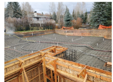
Harker Center Pool