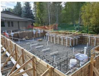
Harker Center Hot Tub

Get Your Dues Statement Online. If you are not already receiving your dues statements online, please consider doing so. You can receive your statements quickly and conveniently by email. Combined with ACH payment options you can save time, expense and the hassle of mailing your payment. Please sign up today for this quick and easy billing and payment method.